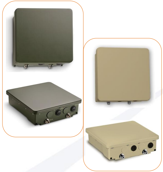
Available in Military Green and Desert Sand colors

Audible tone and real-time signal strength measurement allows quick installation. Pelletier heating and cooling technology inside a ruggedized enclosure enable deployment in extreme weather conditions